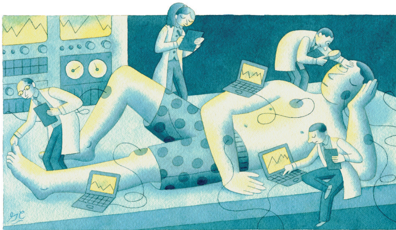
ILLUSTRATION BY GREG CLARKE

SPRING BOOKS Grind, politics and dirty tricks in life of polio-vaccine pioneer p.620