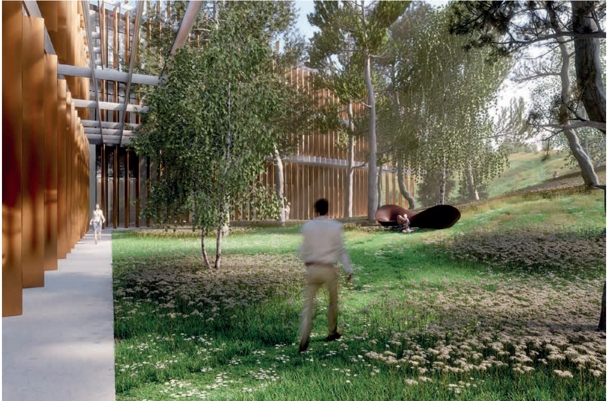
Healing landscapes provide opportunities to relieve stress for all users.