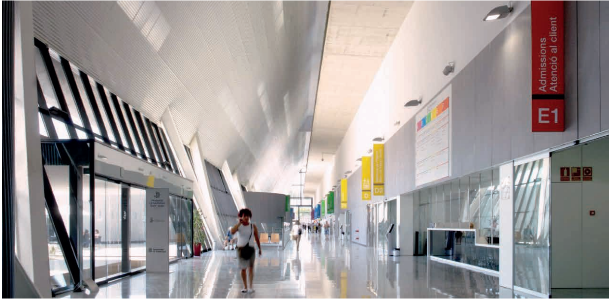
Clear wayfinding, designed with colours and signage increases the user experience when moving around the facility.