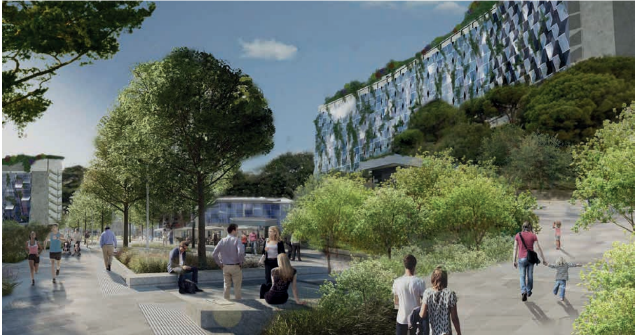
Visualization of hospital refurbishment within the “San Martino Horizon 2040” research project by Politecnico di Milano Design & Health Lab.