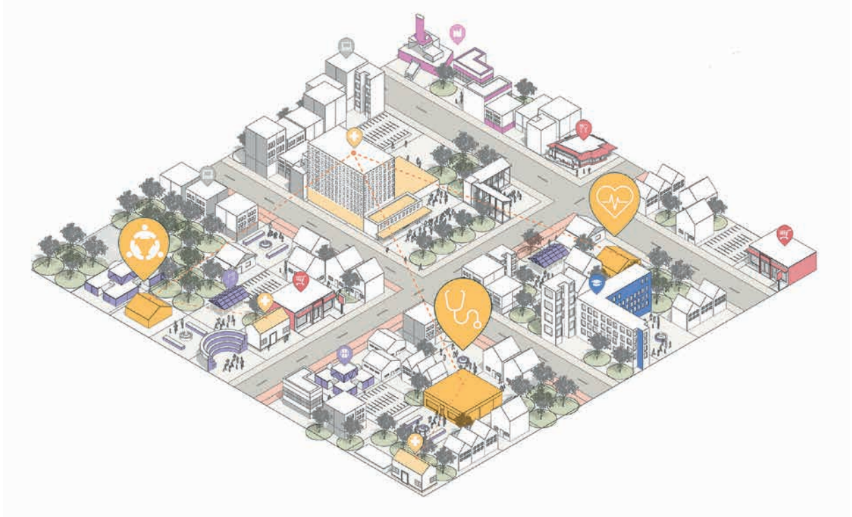
Fig. 1. Territorial Healthcare Network | Visualization of “Territorial Healthcare Network” by Politecnico di Milano Design & Health Lab

© Design & Health Lab, Politecnico di Milano