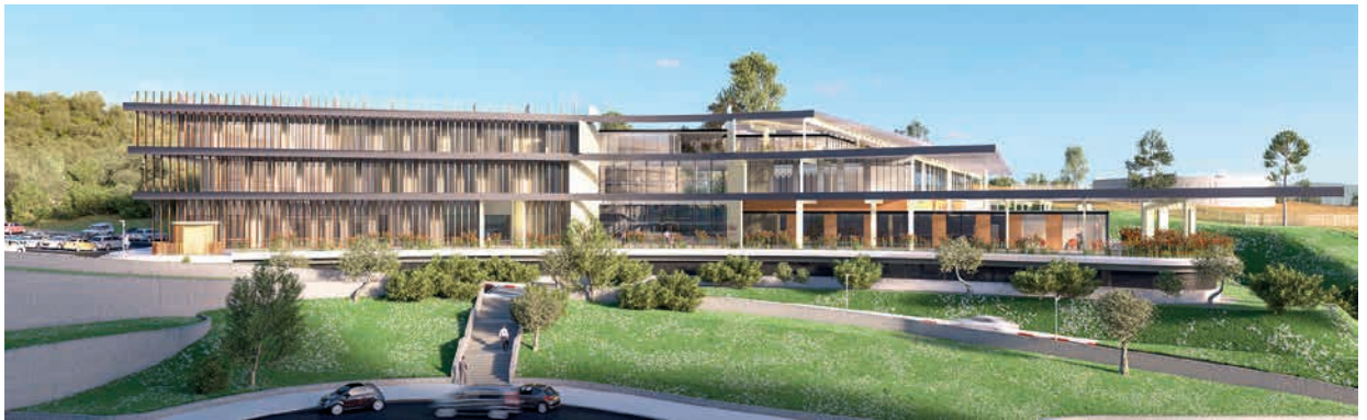
Healing landscapes provide opportunities to relieve the stress for all users.