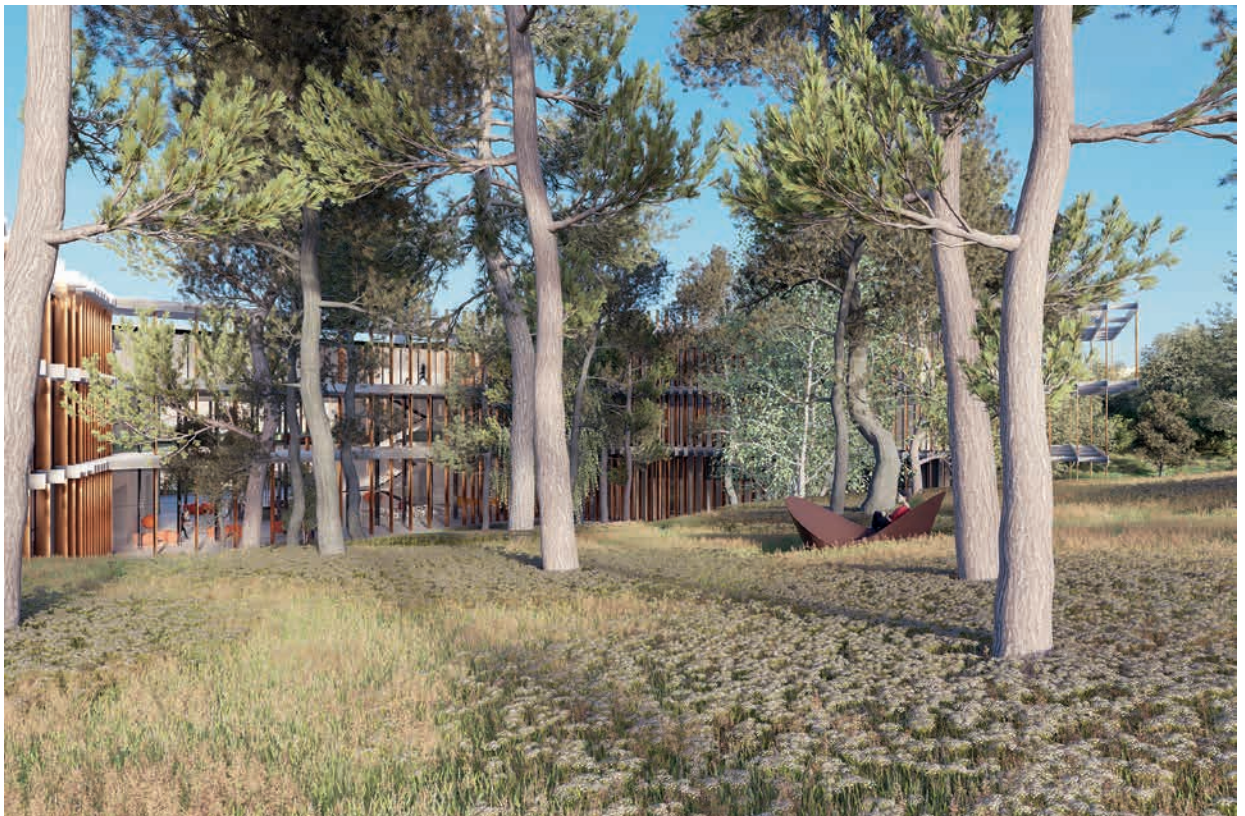
Fences, seating and shaded green space all enhance the healing capacity of the hospital environment.