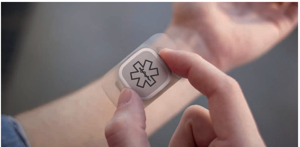
Tiny digital end-user devices can keep monitoring patients' health conditions to provide better health care services.