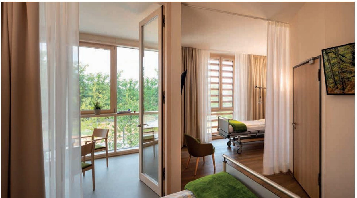
Rooms such as single patient wards can be subdivided according to visual, acoustic, air quality and privacy needs, to improve the quality of the indoor space.

Waldkliniken Eisenberg hospital | Eisenberg, Germany, 2021