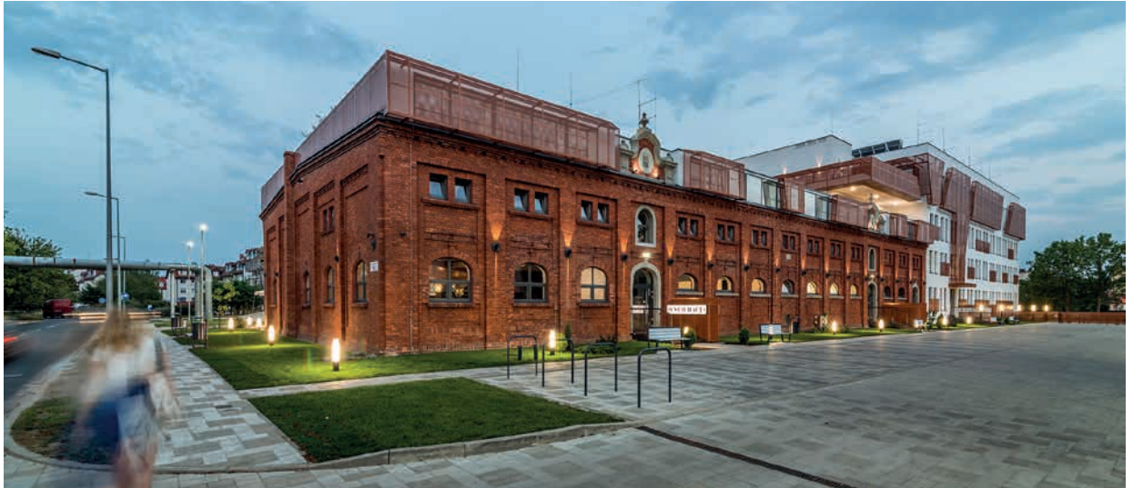
Leszczynski Antoniny Manor Intervention | NA NO WO architekci 2015 | Leszno, Poland

Restoration and extension of three of the former farm buildings and a new building were turned into a coherent complex with all the necessary diverse functions of an elderly care centre, with hospital rooms for people with Alzheimer disease, those undergoing cardiac and orthopaedic rehabilitation and a general hospital ward.