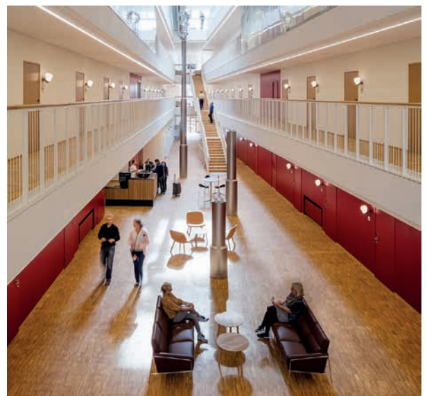
A central indoor open area can provide clear guidance during an evacuation (in an emergency).

Copenhagen's Rigshospitalet | København Ø, Denmark, 2015