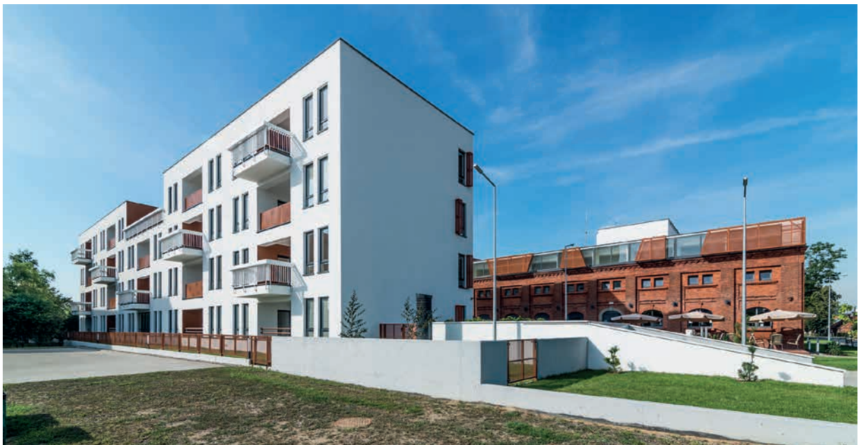
Leszczynski Antoniny Manor Intervention | NA NO WO architekci 2015 | Leszno, Poland

Restoration and extension to become a comprehensive elderly care centre.