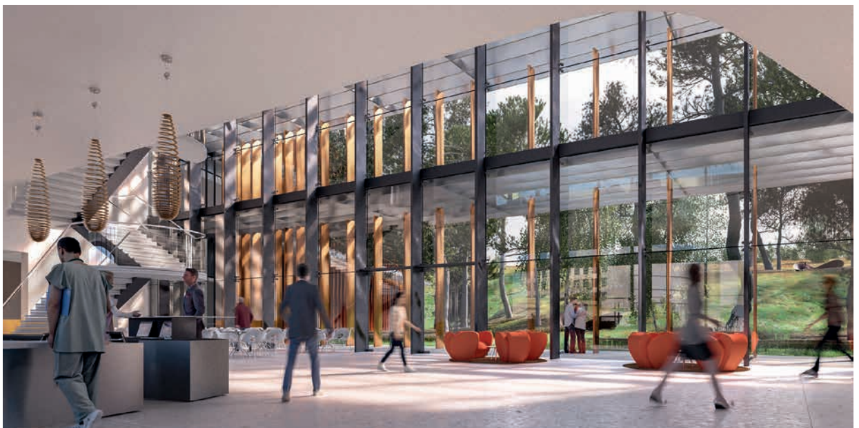
Appropriate seating and its spacing are important, both inside and out.