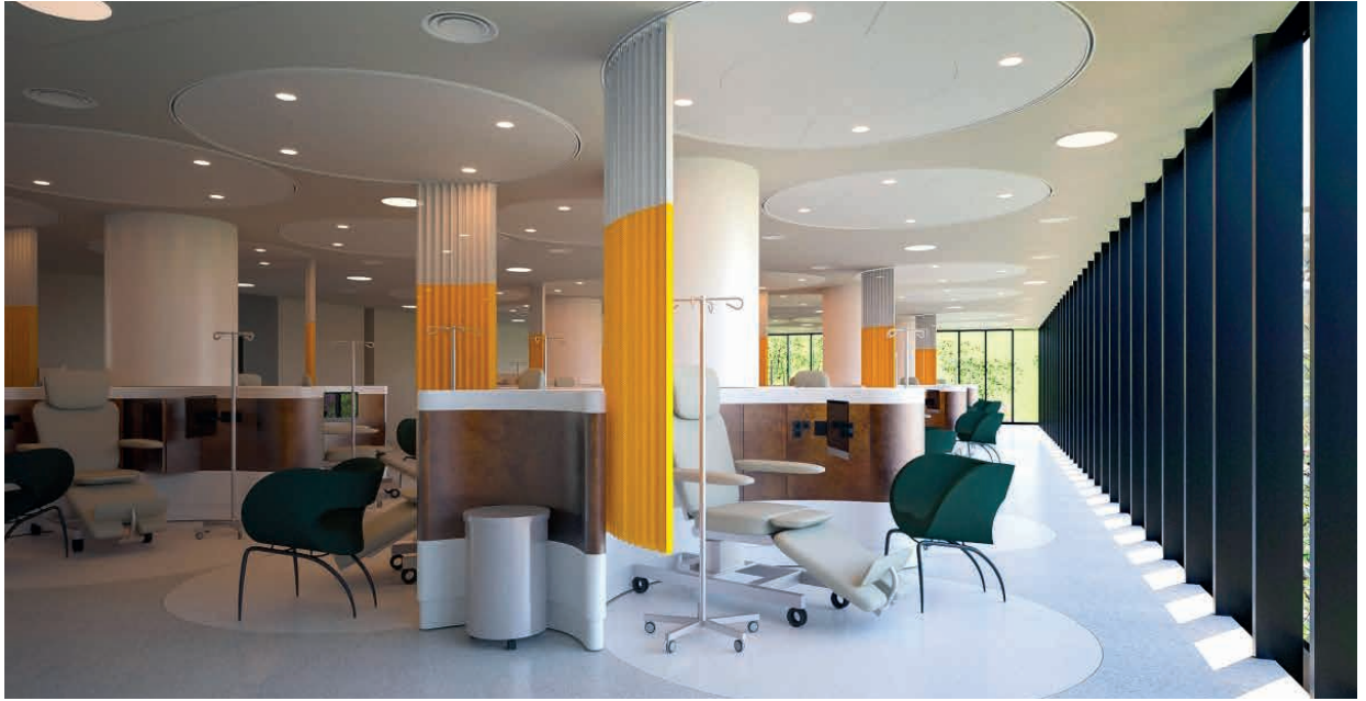
An open view can relieve stress for both patients and health care workers.