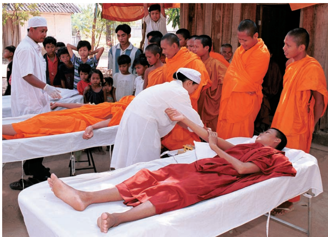
A life saved by safe blood

Whatever the degree of development of the health care system, transfusion is the only option for survival for many patients.